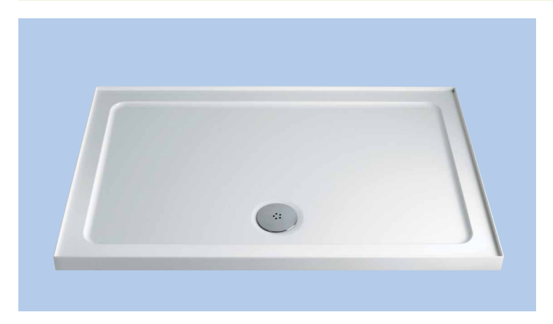
Rectangle upstand tray

legs & panel kit & waste to be ordered separately